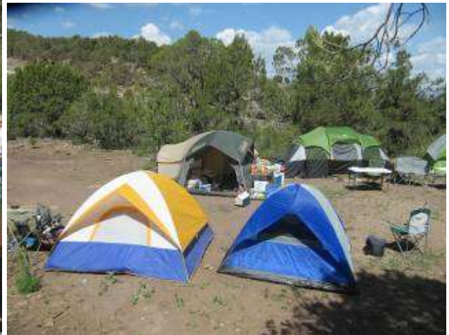
Scouts camping overnight at the Refuge