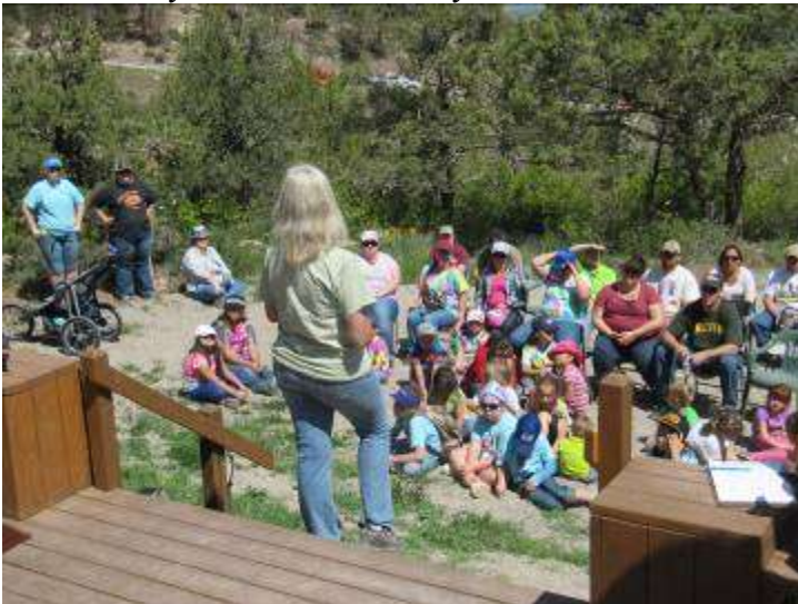
Talking to the Girl Scouts about wolves