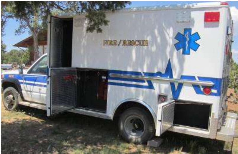
The new ambulance/ soon to be "wolf mobile"