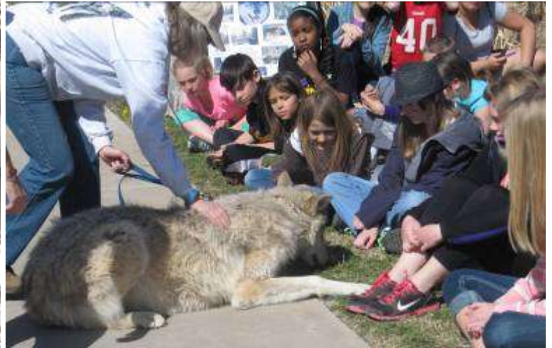
Big O at the Bayfield Library