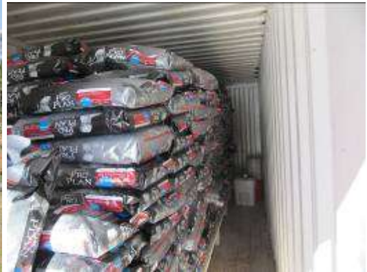
A full container of dog food

There has been more drama in the continuing saga of the Alaska Nine Pack. We had to separate them into two groups. Billy, Sita and Ginger formed their own sub group, and there was a lot of dissention in the pack this spring. It was a traumatic few months for all of us. Both packs are doing very well now. Our original plan was to divide the puppy enclosure, but the bigger group of six needs all that space, so once again we will be building a new enclosure this fall for the smaller pack. They are all two years old now and act like typical teenagers.