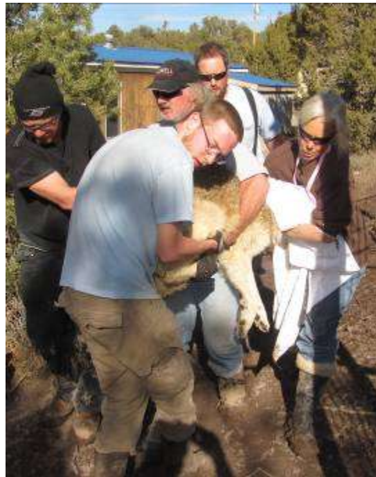
That obviously didn't work!