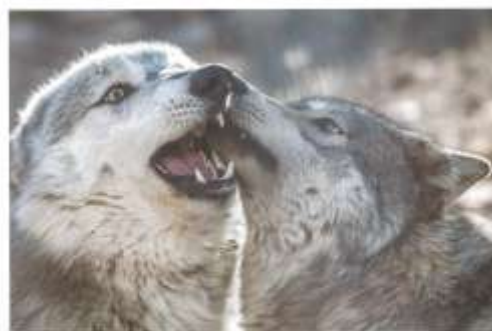
WolfWood Refuge 2014