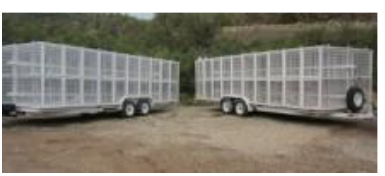
Completed evacuation trailers for 80 animals