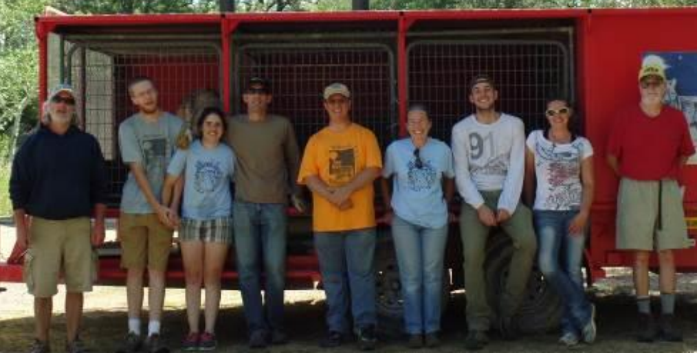
More of the volunteer crew