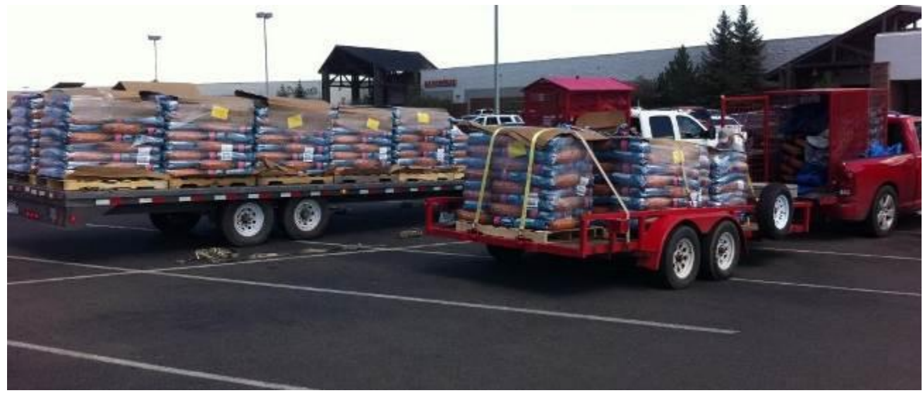
Craig, Chase and Keith pick up 30,000 lbs of food for the winter