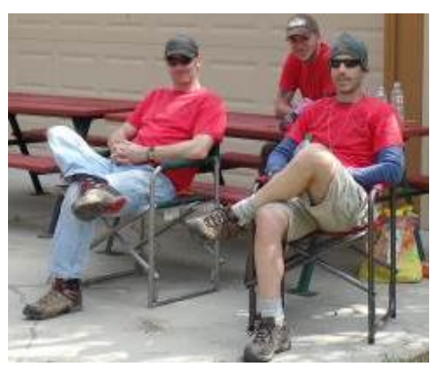
A motley crew