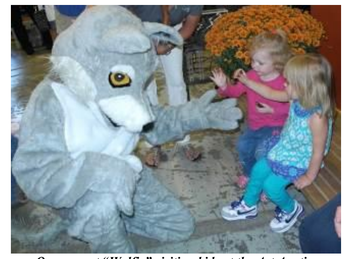
Our mascot "Wolfie" visiting kids at the Art Auction