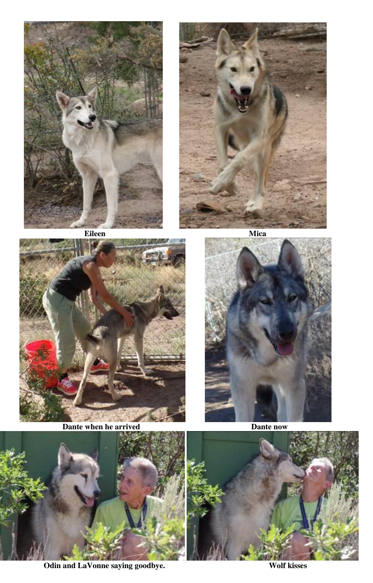
"Wolf..... teach me to know"