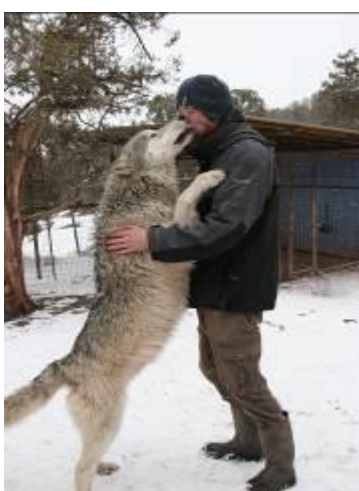
MAY YOUR HOLIDAYS AND THE NEW YEAR BE FILLED WITH LOVE, JOY AND MAJESTY!