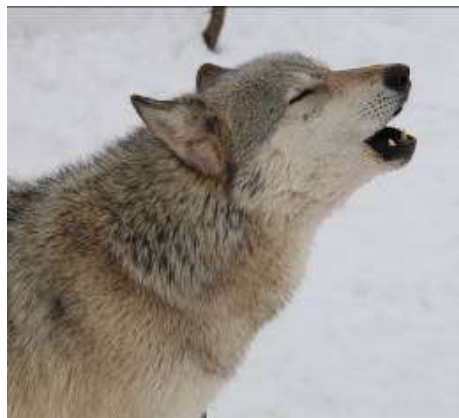
Torq shows how it is really done