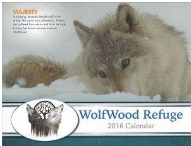
The 2016 calendar is here and available to purchase