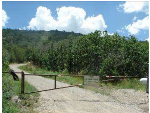
Our new, long awaited, much needed gate