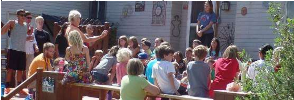
Bayfield Family Center