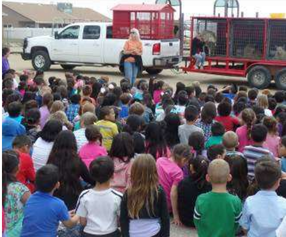
Educational Program at Esperanza Elementary

We are proud to announce that WolfWood's outreach program is bigger than ever. After rescuing animals in need, education of young people and the public in general is our main priority, and we are definitely accomplishing that goal. All of these programs are provided free of charge and everyone is welcome. The ambassador wolves and volunteers have been hard at work. We believe we are making a difference by dispelling myth and misinformation about these special animals