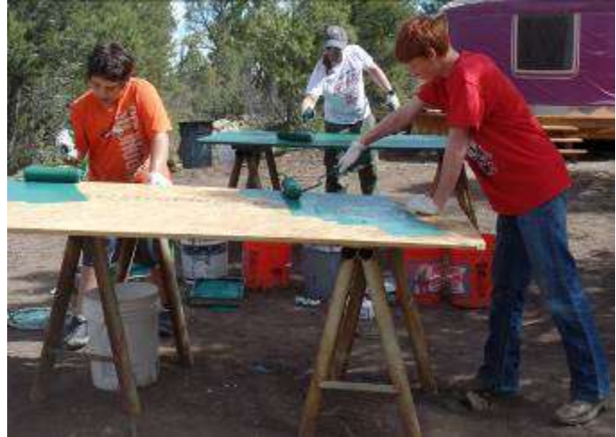
Ignacio students paint dog house roofs