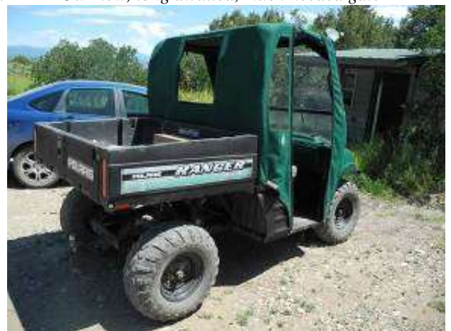
Our improved 4-wheeler