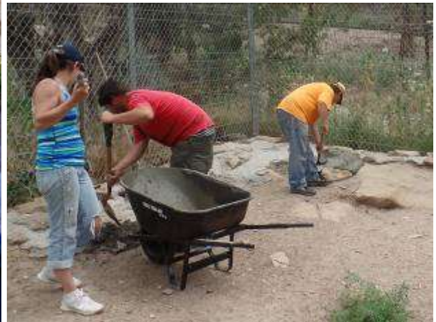
The constant work to keep the USDA happy