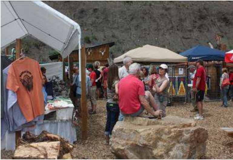
The event at Wolfe Brewery in Pagosa Springs