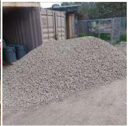
We ALWAYS need more gravel