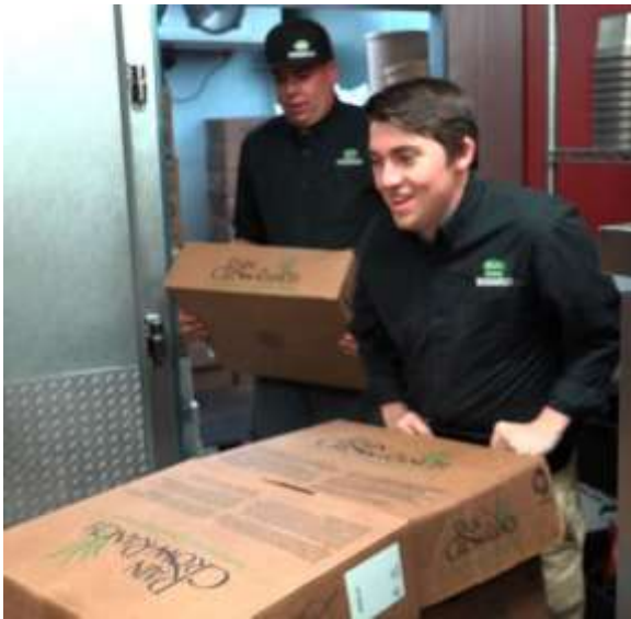
Grassburger loading meat for the wolves