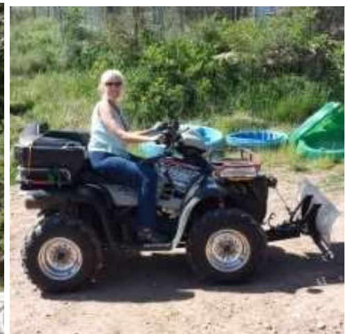
New way to push snow