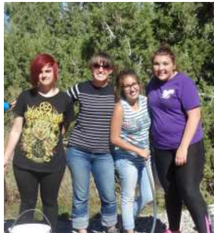
Workday for local teens