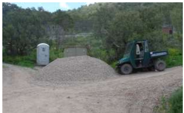
Gravel is always a necessity at the refuge