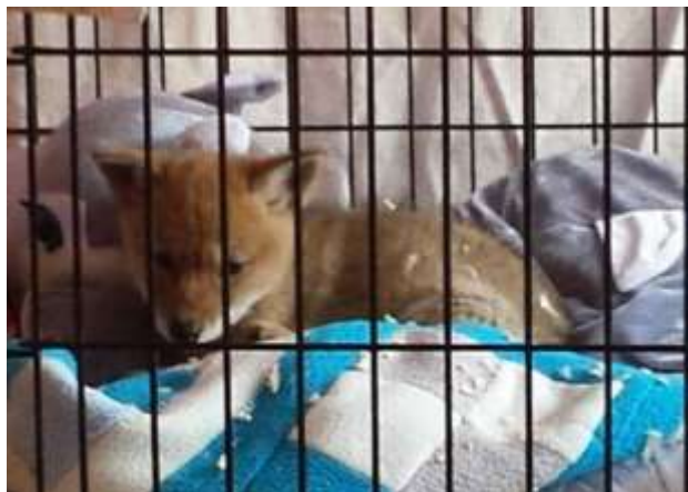
Wile E. when he first arrived

Wile E is very entertaining, engaging and a big challenge. He has already earned the title “trickster” and has us all wrapped around his little paw. Although still in semi-quarantine he has graduated to a temporary outside pen. He is growing every day and is remaining healthy and happy and active. He is very comfortable around people, learning with daily care, love and attention, exactly what humans are capable of.