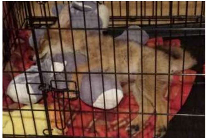
Wile E. at the end of June