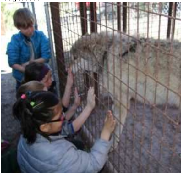
Schools kids love the wolves