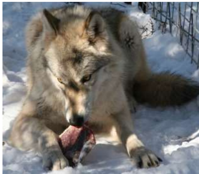
Majesty enjoying donated meat