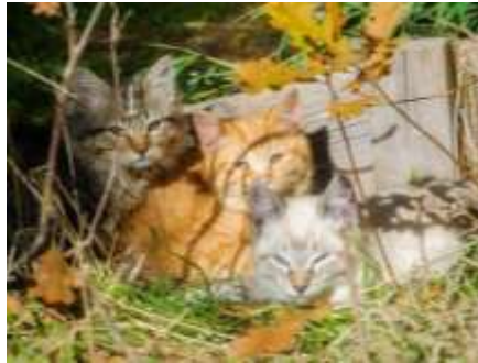
Mama Kitty's legacy