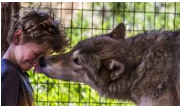
Oakley giving wolf kisses