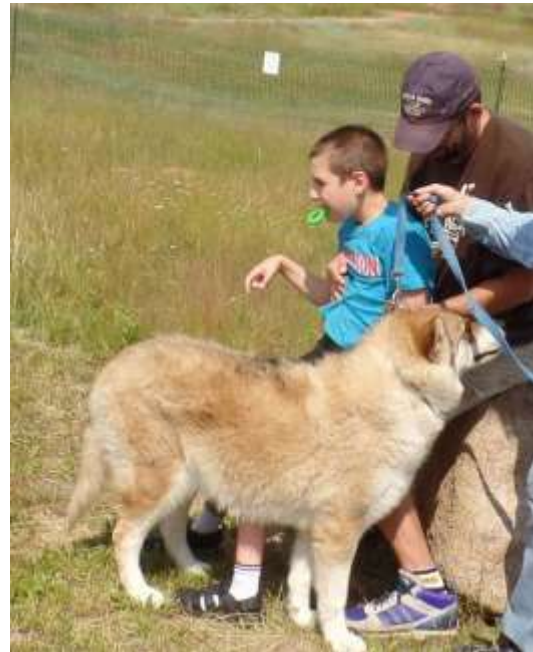
As always, Trinity is patient and loving