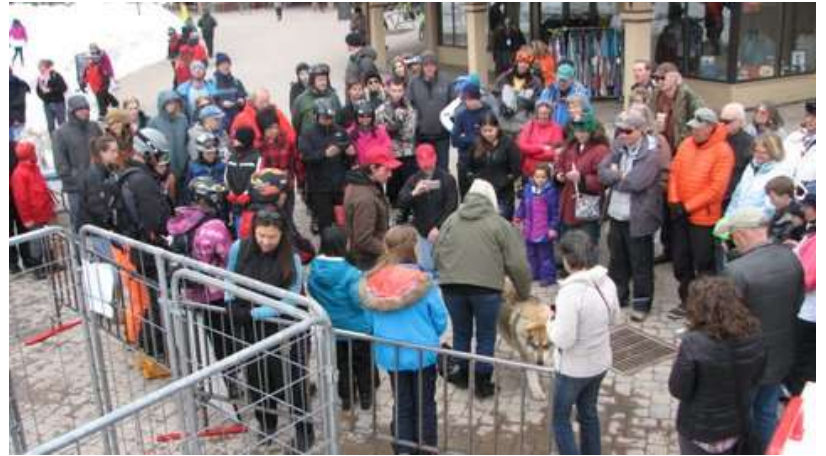
The first event at Purgatory was a big success