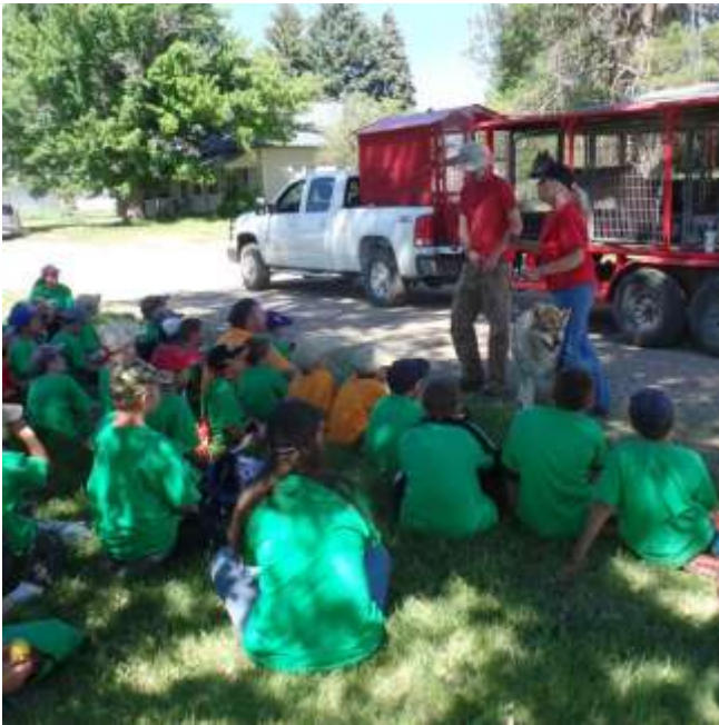
The Cub Scout Jamboree

Pine River Library, Cortez Open School, four different Big Brother and Big Sister's After School Programs, Purgatory Resort, Durango Nature Studies Center, Florida Mesa School, Hope Christian School, Farmington High School, Career Day Dolores, San Juan Outdoor Club, Esperanza School, Open Shutter Gallery, Humane Society Camp, Cub Scout Jamboree, Cortez and Pagosa Schools, three Girl Scout Troops, La Plata Family Center, Bayfield After School Program, Wolfe Brewery, Aztec Boys and Girls Club, Just Us Kids, and four interns from Fort Lewis. Many of these programs donated money raised by the kids. We even had two lemonade stands for WolfWood this year. The support and interaction between kids, local businesses, individuals and the wolves has been amazing and unsurpassed this year. We are truly blessed to be part of the giving community that surrounds WolfWood.