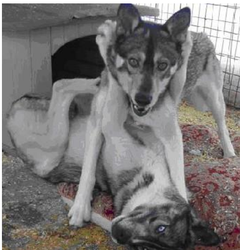
Echo playing with Pan