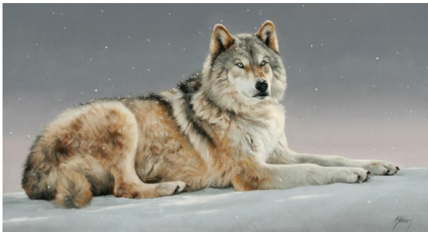
“Ambassador” painting of Oakley donated for the Sorrell Sky event.

Silverton: Equally exciting and successful was our first ever event in Silverton. Rarely have we had such a warm and kind welcome by both individuals, and businesses in town. It was well attended and the animals felt safe and comfortable there. The Durango Silverton Train allowed us to have volunteers on the train to tell everyone about the event. You can be sure we will be back next year!