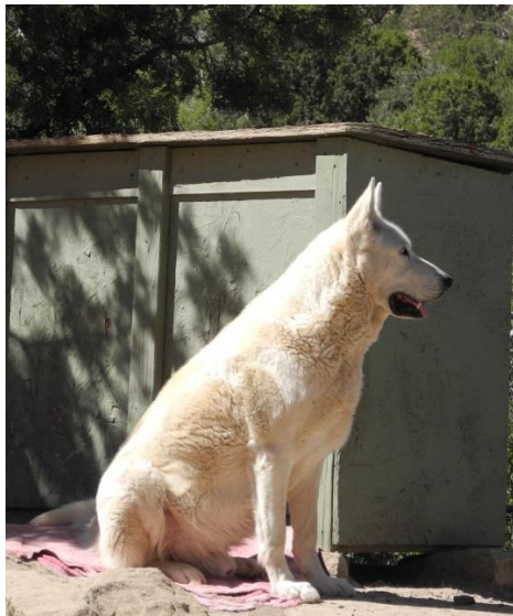
Finn enjoying the view