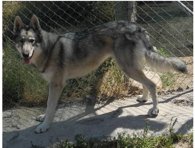
Moki and Xena - We hope they will become penmates