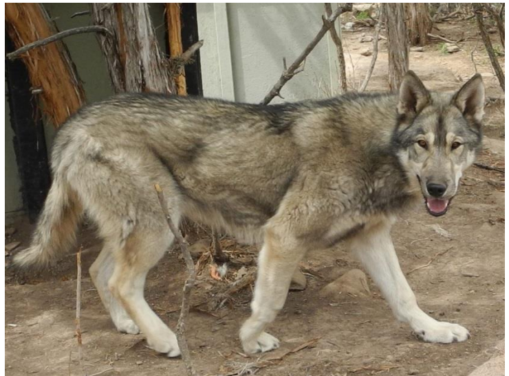
Aldo on the move