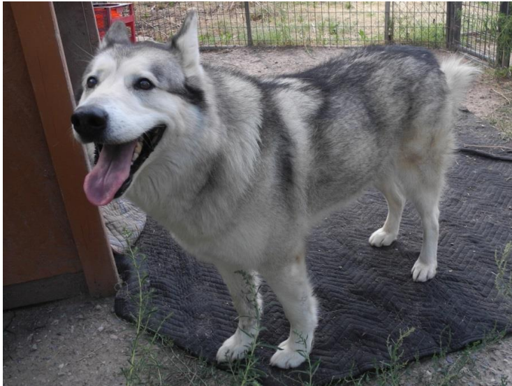
Roxy loves people