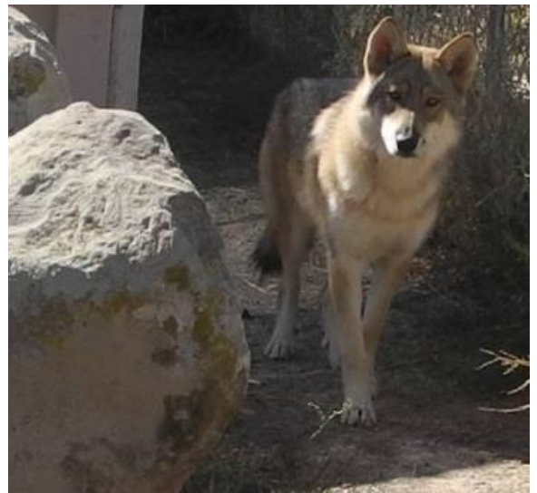
Akula does not